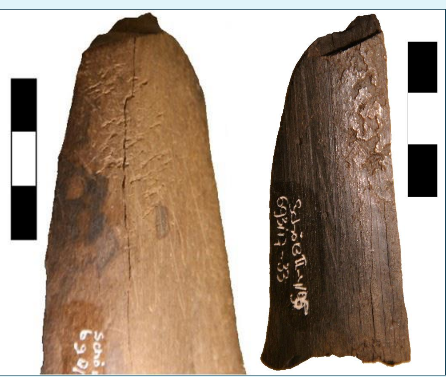
Figure 2. Bone retouchers from the Schöningen 13II-4 Spear Horizon. The limb bone shaft on the left shows dense concentration of hatching marks typical of use in a fresh state. The specimen on the right displays scaled areas and one longitudinal fracture indicating use when relatively dry.