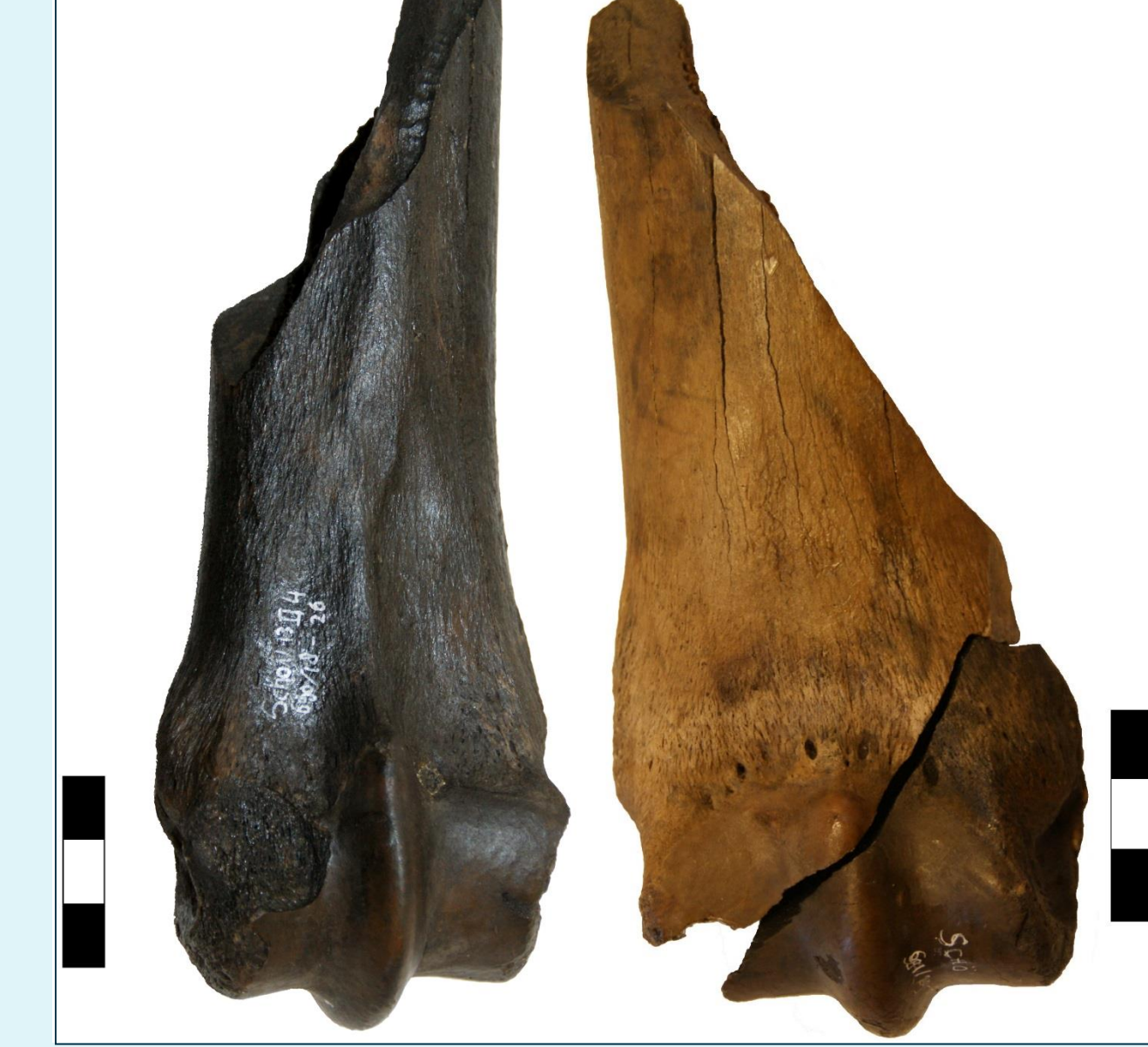
Figure 3. Metapodials used as soft hammers from the Schöningen 13II-4 Spear Horizon. Limited experiments show the specimen on the left, with a small detatched bone flake, was used while relatively dry, and the specimen on the right, with an oblique fracture through the epiphysis, was used when fresh.