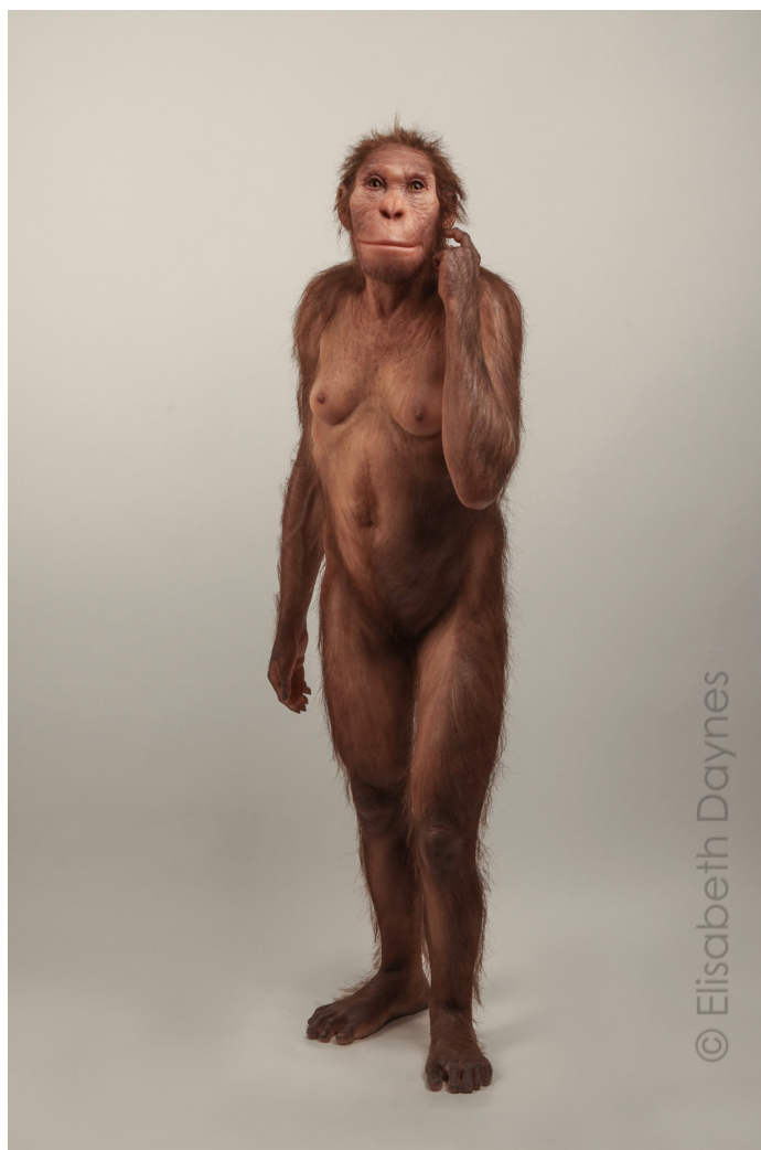
Figure 3. Life reconstruction of Australopithecus sediba commissioned by the University of Michigan Museum of Natural History.