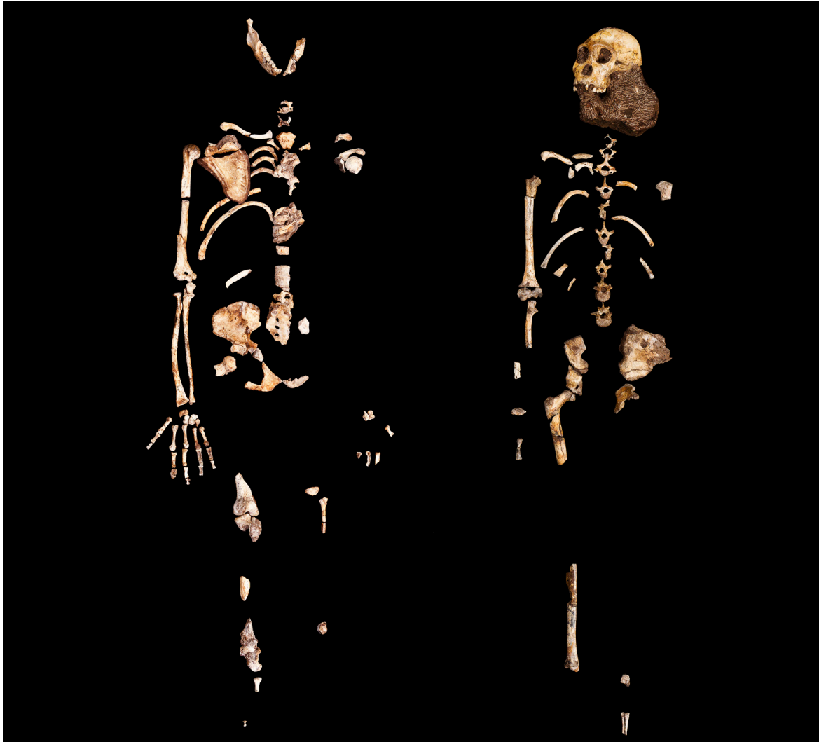
Figure 2. Malapa Hominins 1 and 2 associated fossils in approximate anatomical position. Adult female MH2 is shown on the left, juvenile male MH1 on the right. Note that the tibia positioned with MH1 is thought to belong to another proposed individual, MH4 (photo credit: Brent Stirton/Courtesy of Getty Images).

Au. sediba shares with members of the genus Homo , encompassing a variety of distinct functional systems, suggests to these authors that Au. sediba represents a candidate ancestor to the genus Homo , or a close sister-group to that ancestor. Williams and colleagues describe the postcranial axial skeleton—sternum, vertebrae, and ribs. They find that the Au. sediba vertebrae are among the most diminutive in the hominin fossil record. Additionally, Williams et al. challenge the notion that the Malapa assemblage represents more than one species, showing that there is no convincing evidence for this contention; rather, the postcranial axial material at Malapa is best understood of as the remains of two individuals, one adult (MH2), one juvenile (MH1) of the same species, Au. sediba .