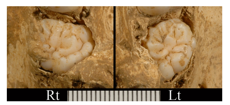
Figure 1. Occlusal views of the Oase 2 maxillary third molars ( M <sup>3</sup> s ). Scale in mm.

N=32), combining western Eurasian samples from the Middle Paleolithic, the Early Upper Paleolithic (Aurignacian), and the Mid Upper Paleolithic (Gravettian); inclusion in the sample of the few known African Middle Paleolithic M<sup>3</sup>s would change the values little. To my knowledge, there are no maxillary third molars securely attributed to the genus Homo ( H. erectus sensu lato and later) that are as large or larger than the Oase 2 molars. The Oase 2 M<sup>3</sup> "area" is, however, matched by the Australopithecus afarensis mean (180.0mm<sup>2</sup>) provided by Wood (1991); it is exceeded by the mean values for other species of Australopithecus .